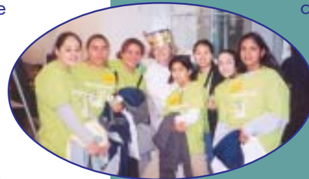
Saturday Service Club for Chicago's inner-city teens