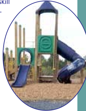
Playground for at-risk kids in New York